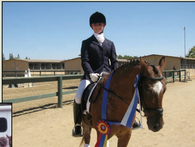
APACHESHEARTMCLEOBAR Owned by Leah Katherine Myers

2008 Master English Pleasure, 2008 Master English Equitation, 2008 Versatility Champion