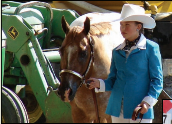
BINGOS MYSTERYBANDIT Owned by Melanie Gatewood