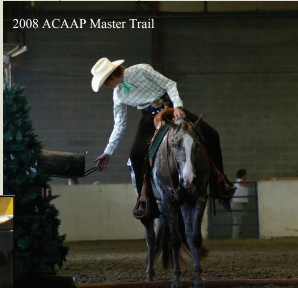
2008 ACAAP Master Trail